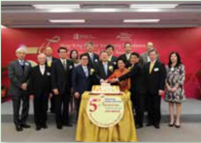
Guests officiating at the cake-cutting ceremony 嘉賓主持切蛋糕儀式