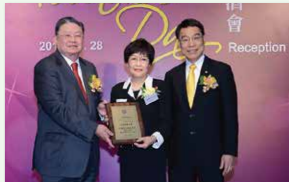
Presentation of Foundation Certificate to Honorary Permanent President 永遠榮譽主席獲頒贈基金證書

香港浸會大學於2014年3月28日舉行校慶酒會，慶祝大學成立58周年。在校慶酒會上，香港浸會大學基金頒贈證書予多位永遠榮譽主席及榮譽主席，以答謝他們對浸大的慷慨支持。